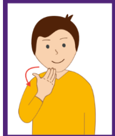
Thanks / Please